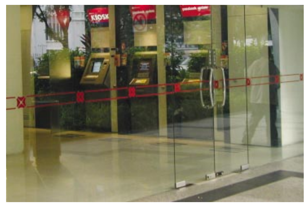
Banking facilities can be located near pedestrian activities to reduce sense of isolation

Most people feel insecure in isolated areas especially if people judge that signs of distress or yelling will not be seen or heard. People may shy away from isolated areas and in turn such places could be perceived to be even more unsafe. Natural surveillance from adjoining commercial and residential buildings helps mitigate the sense of isolation, as does planning or programming activities for a greater intensity and variety of use. Surveillance by the police and other security personnel to see all places at all times is not practical, nor economical. Some dangerous or isolated areas may need formal surveillance in the form of security hardware, i.e. audio and monitoring systems. Aside from its cost, the hardware must be watched efficiently and attentively by staff trained for emergencies.