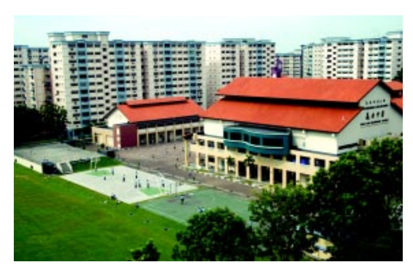
Location and landscaping of school can be arranged to encourage natural surveillance from surrounding buildings and streets