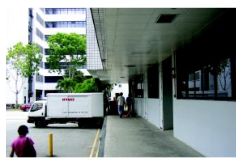
Neat, visible and well-lit loading/unloading areas minimise potential for hiding