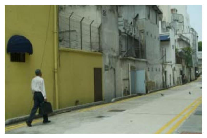
Back lanes should be well-maintained and free of inappropriate outdoor storage