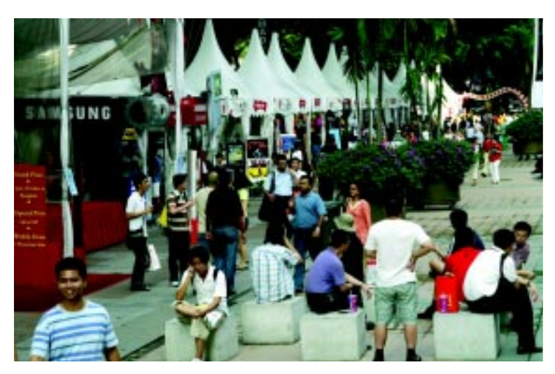
Retail and entertainment uses at street frontages attract and enhance pedestrian activities