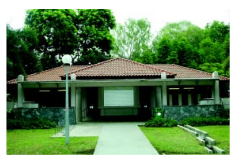
Approach to washroom entrances should be highly visible