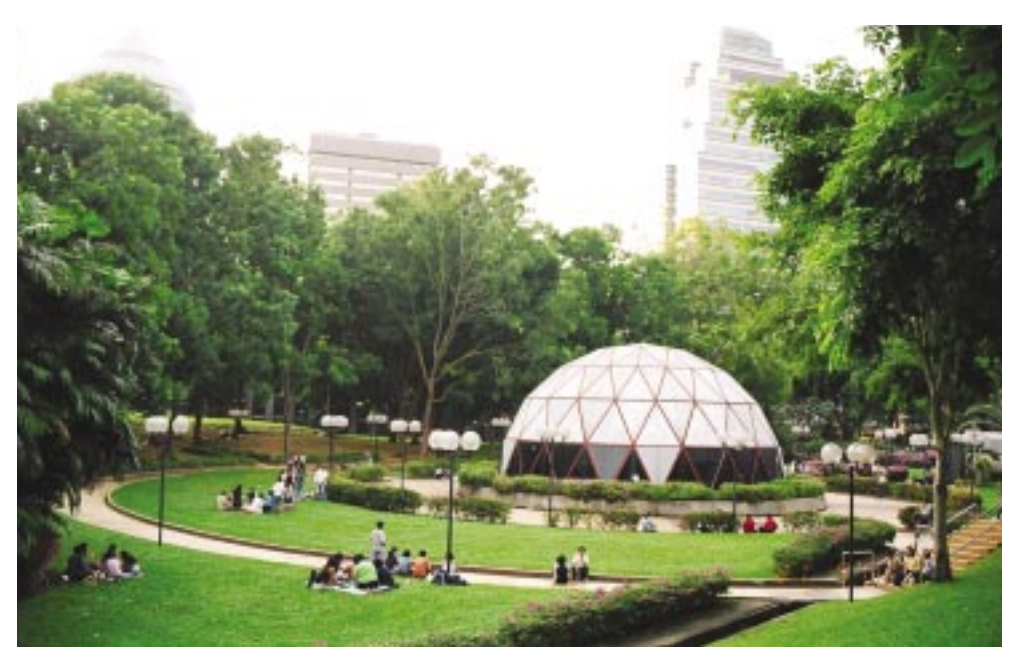
Open space within the central business district can be used for various activities

Activity generators are uses or facilities that attract people, create activities and add life to the street or space and thus help reduce the opportunities for crime. Activity generators include everything from increasing recreational facilities in a park, to placing housing in the central business district or adding a restaurant to an office building. They can be provided on a small scale or be added as supporting land use, or intensifying a particular use.