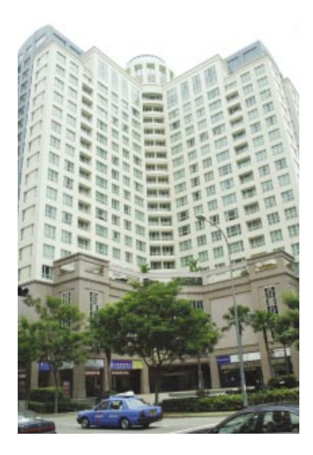
Compatible mixed uses can encourage activity, natural surveillance and contact among people

A balanced land use mix is important for environmental, economic, aesthetic and safety reasons. Mixed uses must be compatible with one another and with what the community needs. For a residential development, a number of uses can be included by having a main street, a town square or park, prominent civic buildings and above all the ability of residents to walk to the place of work, to day care centres and to shops. The social value of frequenting local businesses provides a sense of security and safety as the local business people "watch" the street. Generally, any design concept that encourages a land use mix will provide more interaction and a safer place.