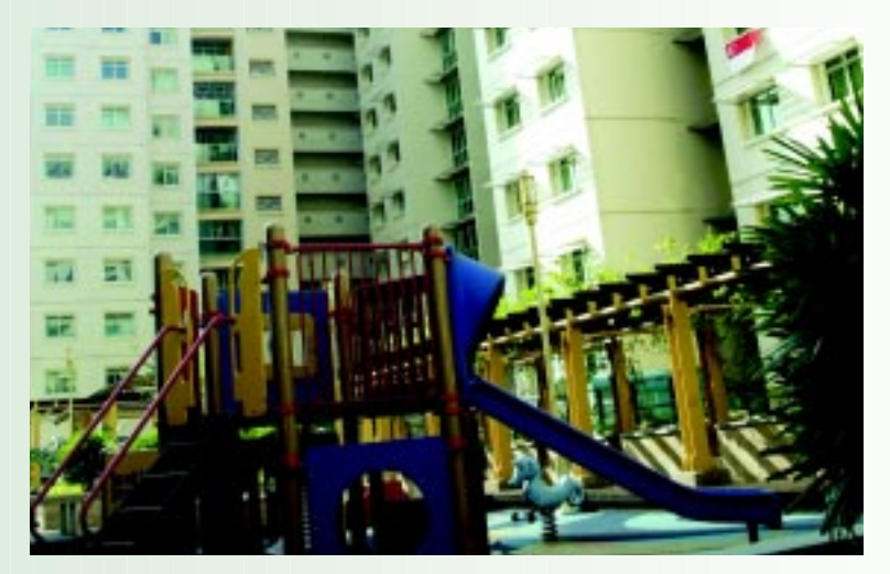
Residential apartments overlooking outdoor play areas provide natural surveilance