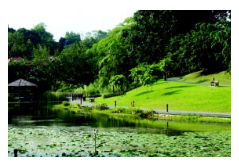
Parks and open spaces can be planned and programmed for a range of activities