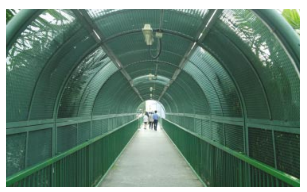
See through fencing covering a predictable route provides visibility

Concealed or isolated routes are often predictable routes that do not offer alternative for pedestrians. An attacker can predict where pedestrians will end up once they are on the path. Examples are underpasses, pedestrian overhead bridges, escalators and staircases. Predictable routes are of particular concern when they are isolated or when they terminate in entrapment areas.