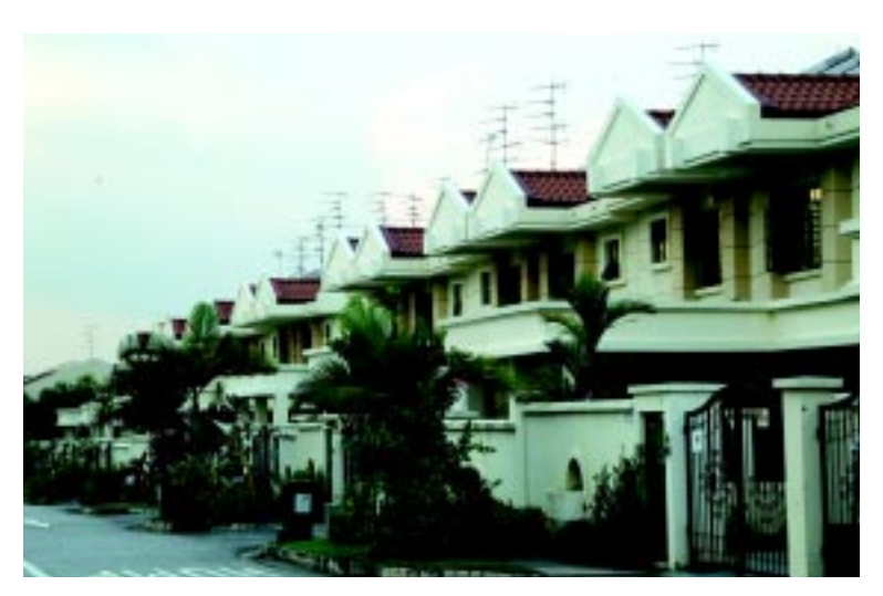
An active resident committee can promote proper management of the neighbourhood