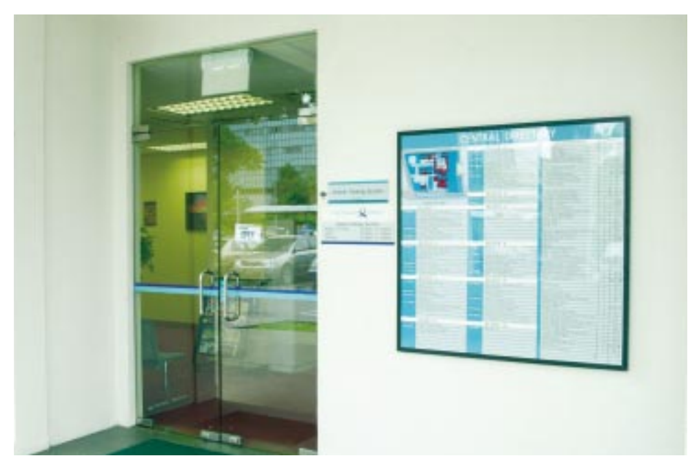
Maps and directories should be well designed and strategically located

Well designed, strategically located signs and maps contribute to a feeling of security. Signs should be standardised to give clear, consistent, concise and readable messages from the street. Having addresses lit up at night will make them even more visible. Where it is difficult to find one's way around; signs with maps may help. Signs must be visible, easily understood and well maintained. Graffiti and other vandalism can make signs unreadable. If signs are in disrepair or vandalised, it gives an impression of lack of ownership and thus adds to a sense of fear.