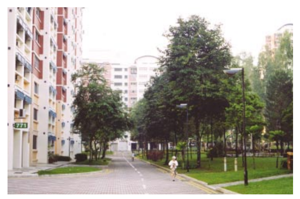
Residential apartments with windows overlooking carpark and park allow for clear sight lines

Sight line is defined as the desired line of vision in terms of both breath and depth. The inability to see what is ahead along a route due to sharp corners, walls, earth berms, fences, bushes or pillars can be serious impediments to the feeling of being safe. Large columns, tall fences, over grown shrubbery and other barriers blocking sight lines adjacent to pedestrian paths could shield an attacker. Alternatively, low hedges or planters, small trees, wrought iron or chain-link fences, transparent reinforced glass, lawn or flower beds, benches allow users to see and be seen and usually discourage crime and vandalism.