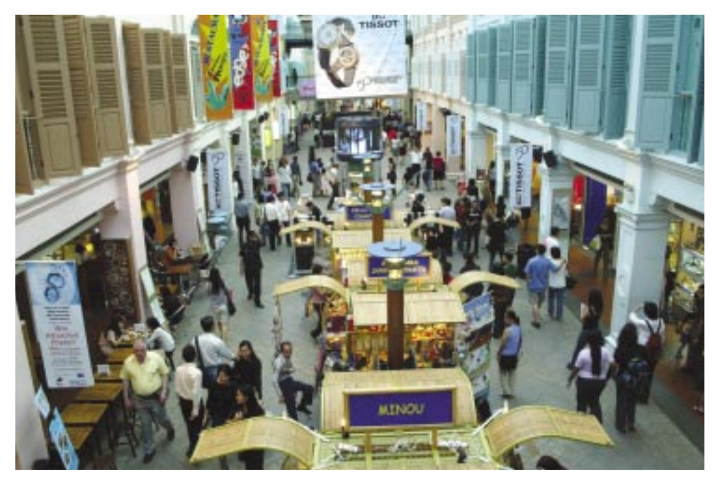
Good functional and aesthetic design can contribute to a sense of safety

The design and management of the environment influences human behaviour. A barren, sterile place surrounded with security hardware will reinforce a climate of fear, while a vibrant and beautiful place conveys confidence and care. Both the functional and aesthetic values of public and semi-public spaces contribute to a sense of safety. In particular, the degree to which users can find their way around influences the sense of security. Good design reinforces natural use of space and lessens the need to depend on signs in order to find one's way around.