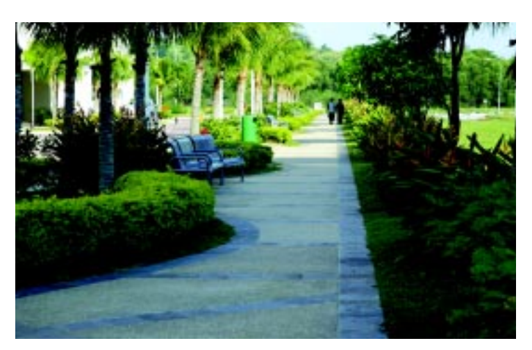
Walkways should be clean and well maintained