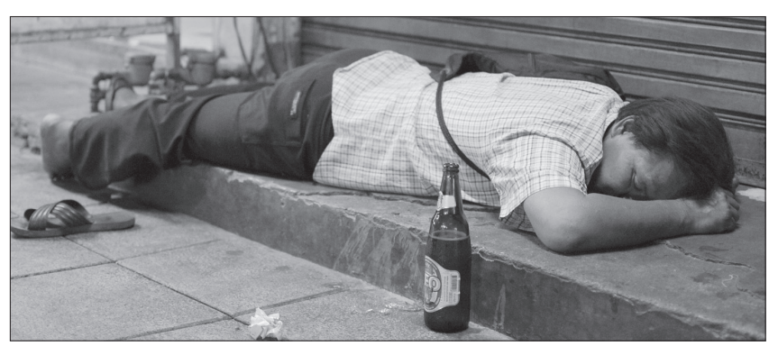
Chronic inebriates such as the one pictured here may become victims of crime, as they are less capable of defending and caring for themselves.