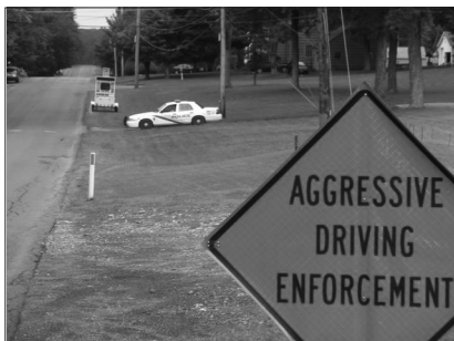
Example of high-visibility aggressive driving enforcement.

Pennsylvania Department of Transportation.