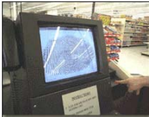
A sales clerk checks a customer's thumbprint.

Researchers have shown that adding simple security procedures can significantly reduce check and card fraud. In one U.S. study in a retail store, 32 a system that used picture IDs of customers who paid with credit cards reduced fraud by over 80 percent. Furthermore, retail stores (especially supermarkets) have found that customer databases that issue customers ID cards can also be used as an effective marketing tool to advertise special sales and promotions. A study in Norway 33 showed that legislation requiring people to show two forms of ID when cashing checks reduced check fraud by over 80 percent.†