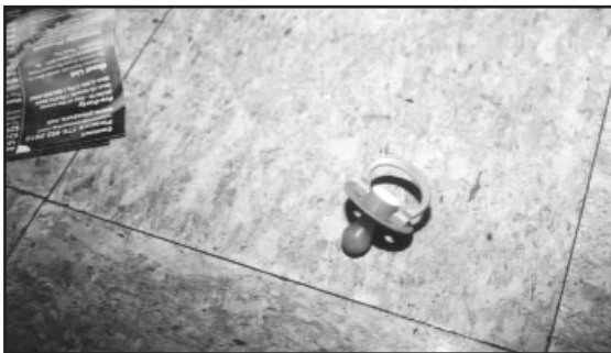
Ecstasy users at raves often suck on baby pacifiers to cope with the drug's jaw-clenching and teeth-grinding side effects.