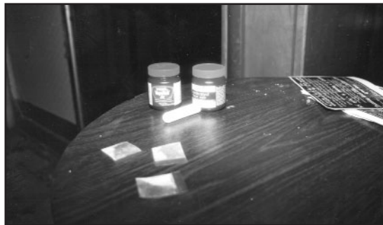
Some ravers inhale mentholated vapor rub to enhance ecstasy's effects.