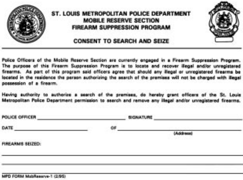
Exhibit 4. The Consent to Search and Seize form

were unaware of the program. The pledge of no prosecution was removed from the consent-to-search form. After 9 months of warranted searches that yielded relatively few guns, the program was discontinued, although it was not officially terminated until 12 months later.