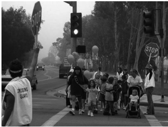
Adding crosswalks and crossing guards is one way to make walking

2. Encouraging students to walk or bike to school. You could encourage students to walk or bike to school if the school curriculum integrates the health and environmental benefits of walking or biking to school into the school curriculum (e.g., encouraging pupils to consider the impact of different transportation choices on the environment as well as their own physical health). You can enhance such programs by enabling students to earn points and/or rewards based on how frequently they walk or bike to school.