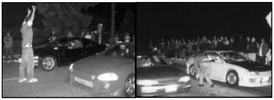
Race starters and observers are often positioned very close to the racing vehicles, putting themselves at considerable risk of injury.

Today in the United States, the racing tradition replays itself during every weekend in thousands of communities in the nation. The primary difference today is that street races are extraordinarily brazen and elaborately orchestrated functions, involving flaggers; timekeepers; lookouts equipped with computers mounted in their cars, cell phones, police scanners, two-way radios, and walkietalkies; and websites that announce race locations and even calculate the odds of getting caught by the police. To Some websites even provide recaps of the previous night's races, complete with ratings of police presence, crowd size, and a link to the police agency so the curious can see if a warrant has been issued for their arrest.