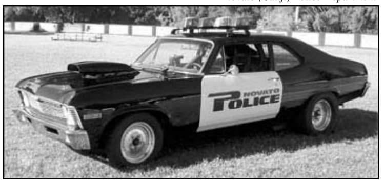
Legal, track-based alternatives to street racing are becoming more numerous. Among them is "Project X", a program initiated in 1997 to bridge the gap between police officers and high school aged street racers.