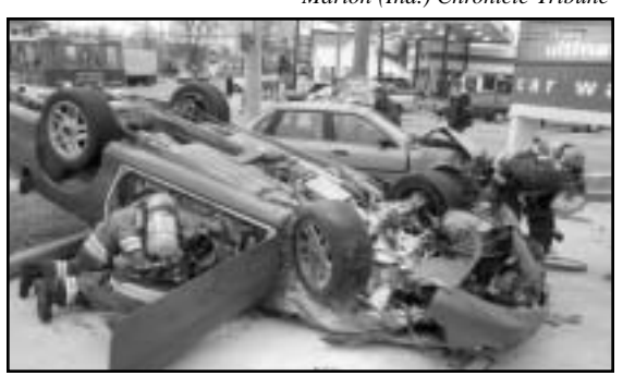
Marion (Ind.) Chronicle-Tribune

Retaliatory offenses may also occur, such as when citizens try to deal with the problem themselves by placing nails on the ground where racers congregate or vandalizing racers' cars, for example.