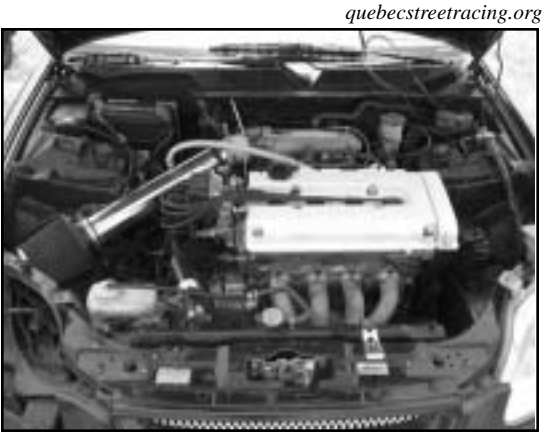
Many street racers spend large amounts of money upgrading their cars' performance.

Police suspect that many racers engage in illegal activities in order to finance their hobby; some agencies report that stolen vehicles have been stripped of parts that were later recovered from street racing vehicles. 6 Whether by lawful or unlawful means, many racers feel they must devote huge sums of money to "soup up" their race cars; a major upgrade, with supercharger blowers, nitrous oxide systems, and other high-performance equipment can easily exceed $10,000.7 For many racers, getting the maximum performance out of their cars is very important to them and they will expend a tremendous amount of time, money, and effort toward that end.8