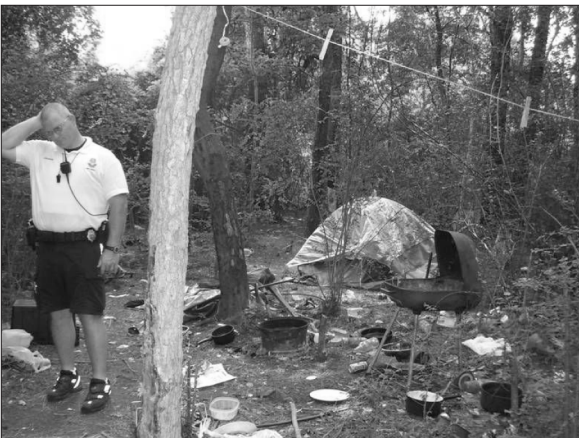
Myrtle Beach (South Carolina) Police Department.

Some encampments, particularly those in the woods, such as the one shown above, can be fairly small with only a few campers.