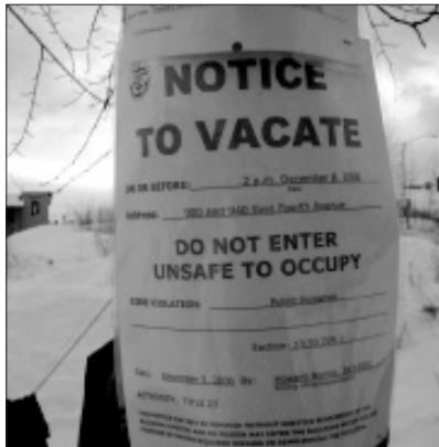
Example of signage posted in a former encampment.

§ See http://file.burbankca.gov/cityclerk/agendas/ag_council/2007/ag032007_Minutes.html for a good discussion about the legal implications of different methods of controlling abandoned shopping carts.