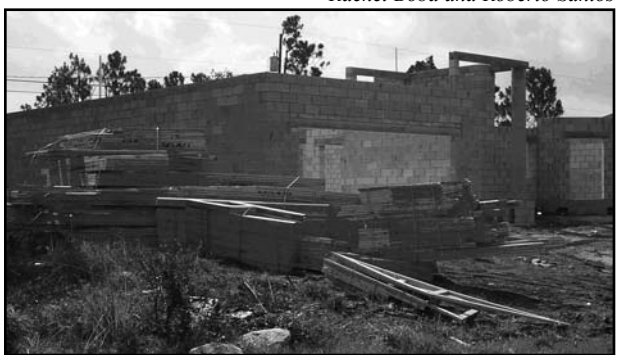
Example of large scale building materials being left unprotected during the early stages of a construction site.