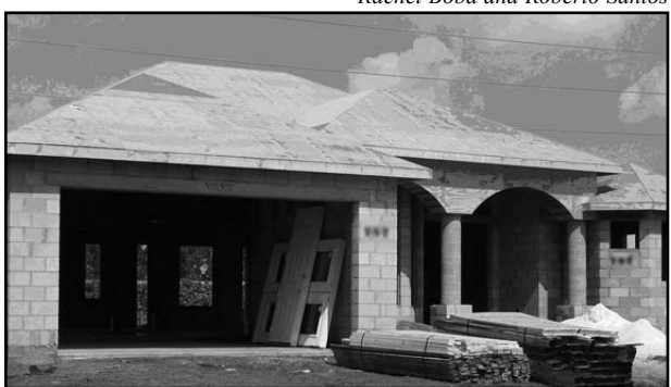
Example of a construction site with building materials and uninstalled doors left unprotected.