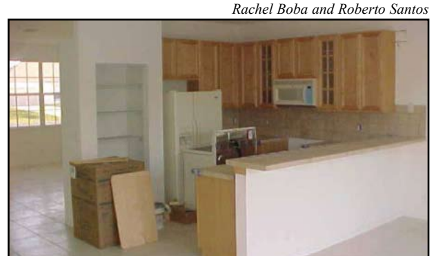
In this house under construction, the front door was left wide open with appliances left uninstalled in the kitchen.

that their employer does not care if tools are taken or may convince them that burglars are unlikely to be caught and prosecuted. Finally, many builders treat burglary as an unavoidable cost of business and seek to offset their losses by increasing house prices.