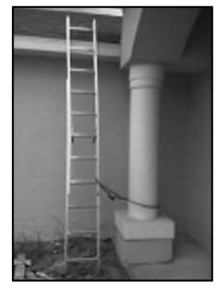
Example of target hardening of construction equipment.