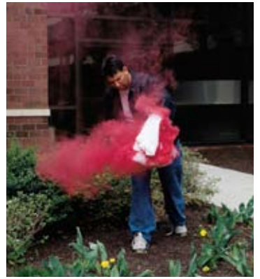
Dye packs that stain both the robber and the cash are widely used by banks.