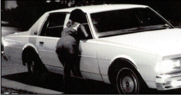
Street prostitution thrives along roads where prostitutes can talk to drivers from the curbside.

Prostitutes usually take clients to places that minimize the risk of violence and ensure that transactions occur without incident. 21 These places are often near the street where the negotiation occurred so that the amount of time required for each transaction is limited. Most are out of sight of passersby but not so secluded that prostitutes will be unable to attract attention if they need help.