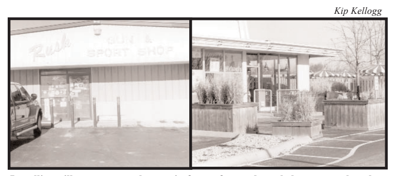
Installing pillars, posts or planters in front of store doors helps prevent burglars from driving vehicles through the doors.