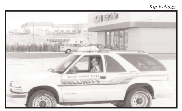
Private security patrols around large shopping malls help reduce burglaries to retail establishments located in and around the malls.

9. Screening and training shop staff. It is good security practice (where law permits) to screen prospective employees for criminal records. It is also good practice to train staff in security measures, to clarify their responsibilities (particularly for key security), and to encourage their involvement-for example, by keeping watch for suspicious behavior and unfamiliar vehicles.