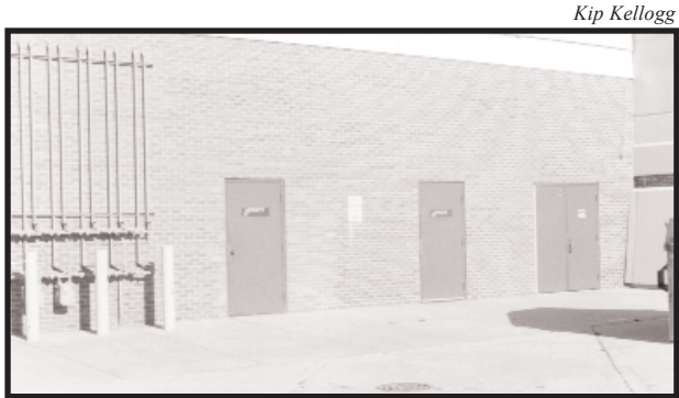
Site surveys of stores should include an assessment of the natural surveillance, lighting and security of the stores' rear entrances.

• Using computer mapping of incidents. Computer mapping of retail burglaries can reveal risk patterns and suggest possible reasons for those patterns. For example, burglaries may be clustered near a bar area, a drug market or a public transport hub. Or heavy clusters of repeat burglaries may indicate that a prolific burglar lives nearby. Mapping prolific offenders' addresses in relation to incident clusters may also be helpful.