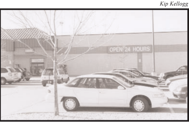
Stores that are open around the clock are protected from burglary by the constant presence of staff.

People's presence in and near stores protects them from burglary, and this factor varies with the nature of the premises. For example, several studies have suggested that stand-alone superstores located away from the downtown area are particularly at risk, because the sites are deserted at night. Supermarkets open around the clock are protected from burglary by the staff's constant presence, and mall stores seem to be at reduced risk because they tend to be protected by security guards after hours.† Shops in busy downtown areas also appear to have lower burglary risks, again due to the constant surveillance passersby provide.<sup>12</sup>