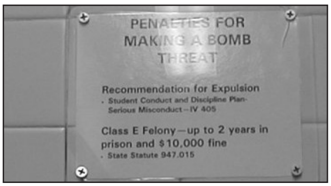
Signs should clearly communicate to students the prohibition against and penalties for making bomb threats.