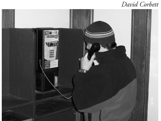
Bomb threats have often been called in via pay phones which reduced the likelihood that police could locate the individual placing the call.