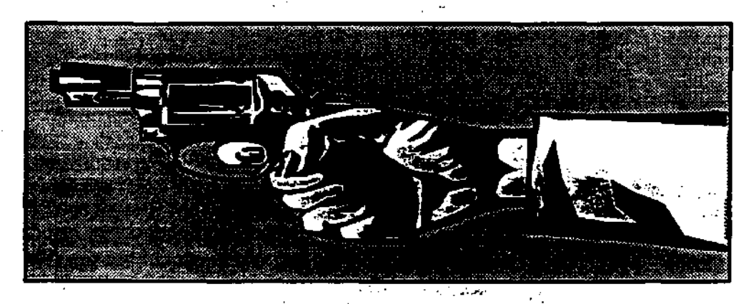
If you have information of an incident involving a gun! Call 293-7000